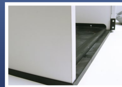
Durable modular base slides easily and supports door