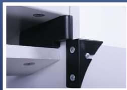
190° nylon hinge for unobstructed collection